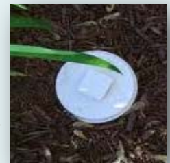
Example of a sewer clean-out port.

pool filters over landscaped areas instead. The fresh water from your hose will dilute the chlorine, so it won't harm plants or grass. Thanks for being water smart.