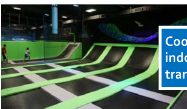
Cool fun on indoor trampolines

Escape Rooms- Do you love puzzles? Locked in a room for an hour, you must solve puzzles and challenges in order to escape.